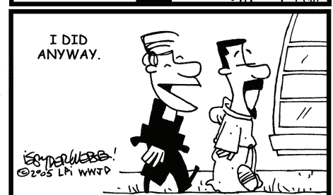
PRIORITY OF VALUES